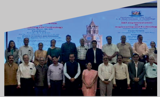
APSIT proudly hosted the Mega Event on National Education Policy Implementation in Engineering and Technology, January 2025.