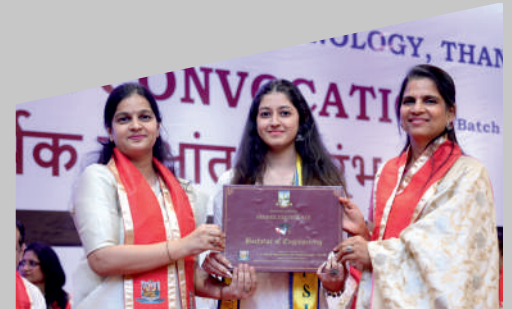
Convocation Ceremony @APSIT