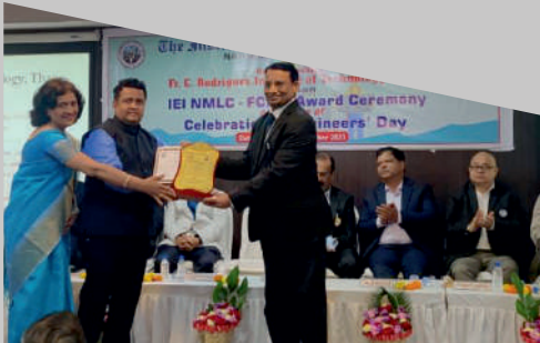
APSIT is honoured with the "Academic Excellence Award" by Institution of Engineers, India for year 2023.