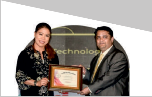
APSIT has been ranked No.1 In Mumbai Region (All India Rank 5) in Times of India Engineering Survey 2022 in Emerging Engineering Colleges category.