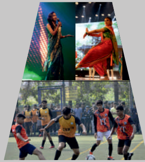
Annual Cultural Festival: Ojus 2025