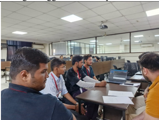
Fig.3 Hackathon in Action