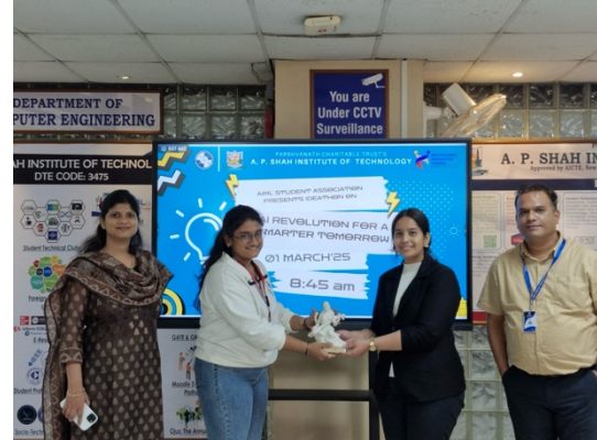
Fig.6 Panel Felicitation