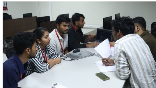
Fig.4 Brain Storm Session