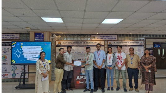
Fig.5 Winning Team