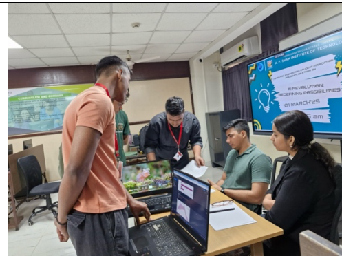
Fig.2 Project review